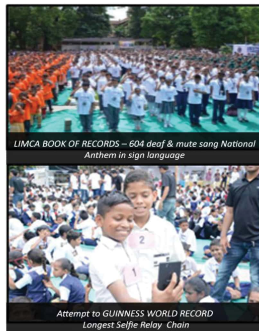
Limca world record for 604 deaf & mute students singing our National Anthem.