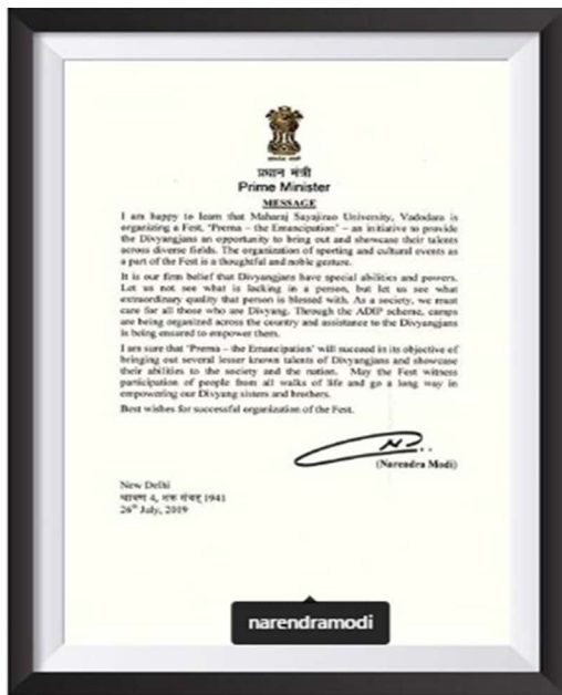
Appreciation from Narendra Modi

It is the only event of Gujarat to get this achievement.