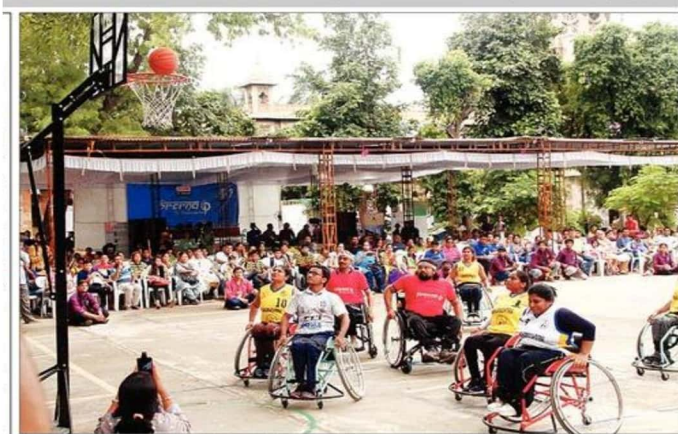
એમ.એસ.યુનિ.ની ટેકનોલોજી કેકેટીમાં આયોજિત 'પ્રેરણા' ઉવેન્ટના બીજા દિવસે વ્હીલચેર બાસ્કેટબોલનું આયોજન કરાયું હતું. જેમાં દિવ્યાંગ ખેલાડીઓ રમતના મેદાન પર એકબીજાને ટક્કર આપતા જોવા મળ્યા હતા.