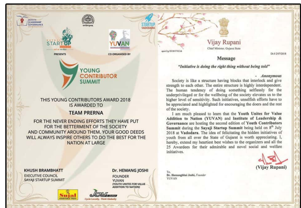
PRERNA was awarded with "The Young Contributor 2018" certificate at Sayaji Startup Summit for its never ending efforts for the betterment of the society and community